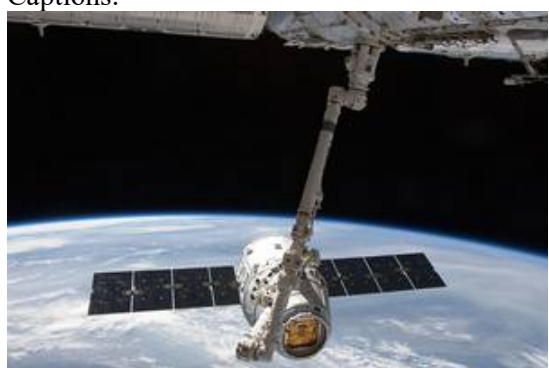
Image 1: Global space industry has been expanding in the last decade; photo description and courtesy: Satellite Space X by NASA.